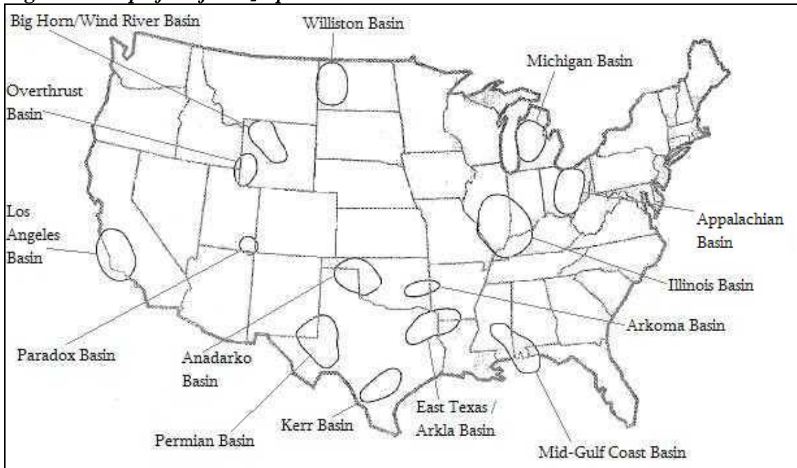
Figure 1. Map of Major H 2 S-prone Areas in the Continental United States 18

The most comprehensive source on the distribution of sour gas is a report prepared by consultants for the Gas Technology Institute, formerly Gas Research Institute, a research, development, and training organization that serves the natural gas industry. 16 This report states that “Regions with the largest percentage of proven reserves with at least 4 ppm hydrogen sulfide are Eastern Gulf of Mexico (89 percent), Overthrust (77 percent), and Permian Basin (46 percent).” 17 Figure 1 illustrates the major H 2 S prone areas in the United States and identifies the basins.